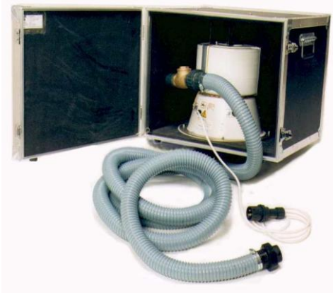
Previous Model APU

Do NOT use the unit inside a meter room unless the room has been tested and proven to be free of gas.